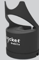
Durable Retractable Clip AC4130-1828