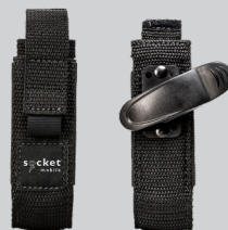
Lanyard - Black SKU# AC4100-1692