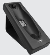
Scan Charge Dock SKU# AC4133-1871